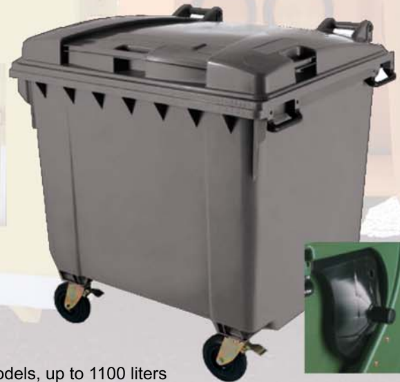
All models, up to 1100 liters