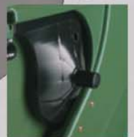
D6208 & 12 only

Perkins Manufacturing Company 737 Oakridge Drive Romeoville, IL 60446 (708) 482-9500 Fax: (708) 354-5878 Email: tuckaway@perkinsmfg.com www.PerkinsPAC.com www.PerkinsMfg.com