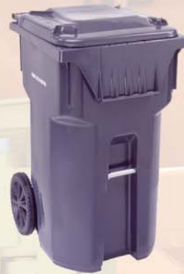
D6207 & 08 only